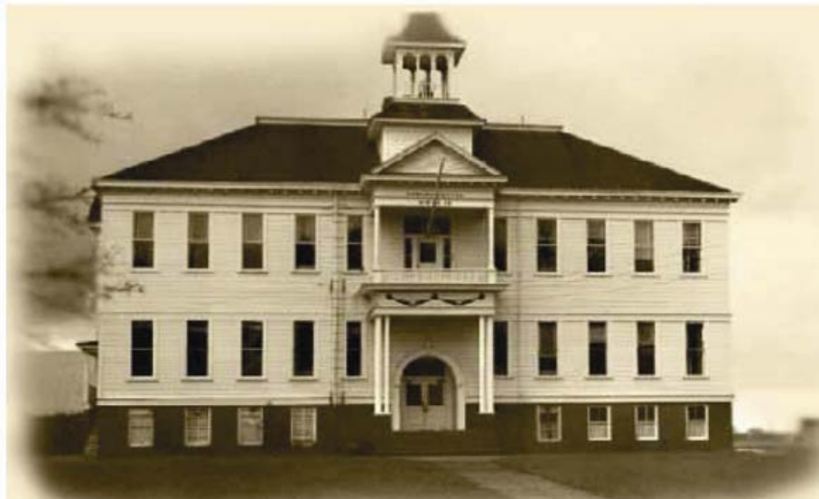
Old Coburg School – Est. 1912

City of Coburg P.O. Box 8316 Coburg, OR 97408 Phone: (541) 682-7850 Fax: (541) 485-0655 www.coburgoregon.org