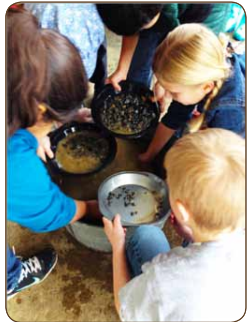
CCCS students try their hand at panning for "gold" as part of Heritage Day.

have priority placement at CCCS, and we encourage all local families to apply.