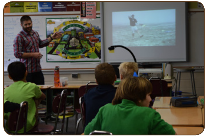
Skills Days at CCCS—Media

Students have been busy at CCCS! February wrapped up winter Skill Days where students participated in a variety of classes including self defense, roping, sewing, international studies, small animal care and much more! Skill Days are unique to CCCS tying the school and community together. If you have a hobby or skill you would like to teach, our next and final