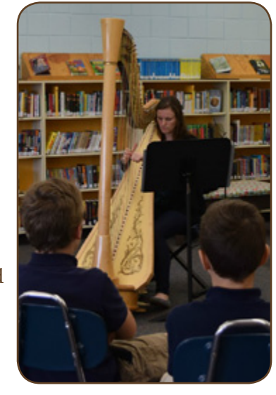
Skills Days at CCCS—Music

of the importance on workforce readiness, entrepreneurship and financial literacy. No teaching experience in required to volunteer! Junior Achievement, a non-profit organization provides all the required materials. Volunteers are needed to make this program a reality at CCCS this spring. If this program interests you,