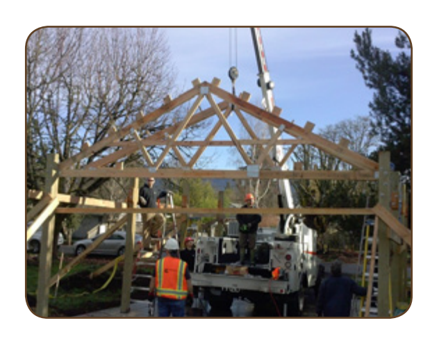
continued on page 4 - Ford Institute Leadership Program

Support for this project has been widespread, and it would not have been successful without the efforts of all those who worked together to make it possible. Watch for information on the ribbon cutting coming soon.