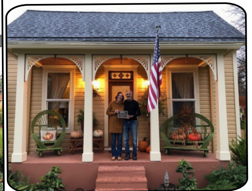
NC and Rebecca Burns House