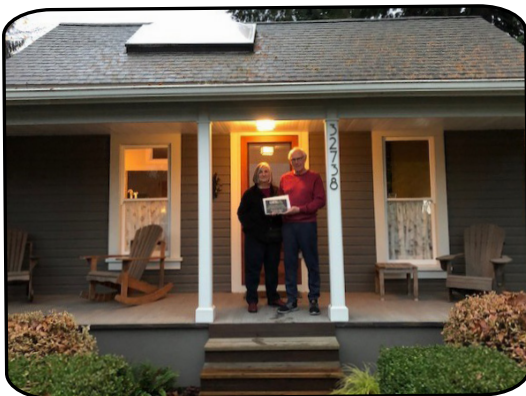
Alice Balch House

The Coburg Heritage Committee honored the Diamond House built in 1890, the NC and Rebecca Burns House built in 1894, and the Alice Balch House built in 1906 with plaques recognizing the properties historical significance in the Coburg community. As a continuation of this Certified Local Government (CLG) project, three more historic preservation plaques will be awarded by the Heritage Committee in 2022.