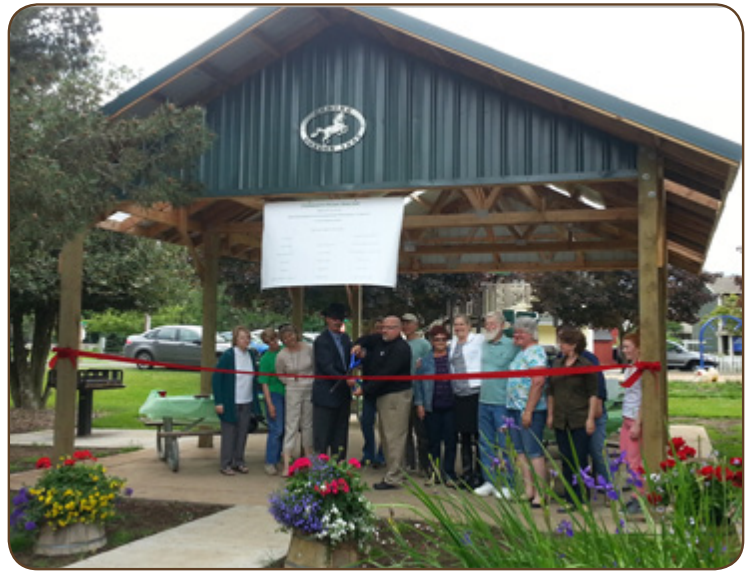
The Ford Institute Leadership Program Coburg Cohort celebrates the official opening of the new picnic shelter.

The new picnic shelter in Norma Pfeiffer Park is ready just in time to help you make the most of your summer. The shelter was the culmination of a community leadership program sponsored by The Ford Family Foundation. Volunteers received training in various aspects of community building, project planning, and implementation. The leadership program participants raised funds for the shelter through donations of both money and materials from local businesses and organizations. The Ford Family Foundation also awarded a grant to help fund the project. No city dollars were used to complete the project although the City of Coburg was a valuable partner in many other ways and an important part of the project's success.