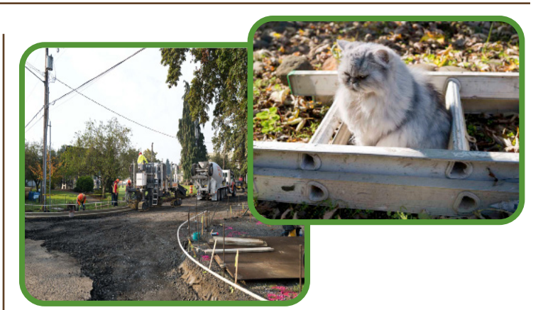
Supervisor of the E. McKenzie Street Construction Project

"Just keeping my eyes on the workers to make sure they are doing a great job."