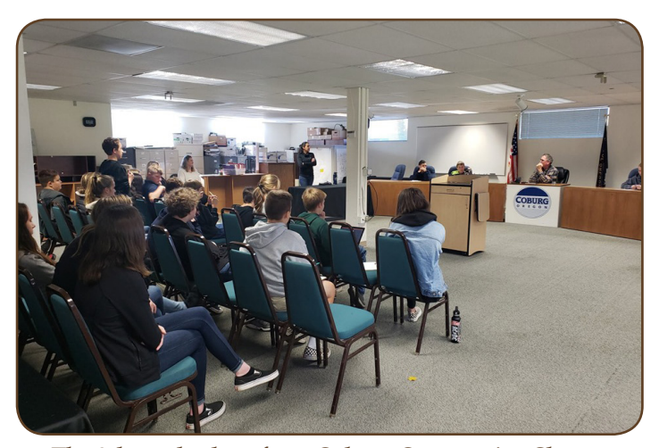
The 8th grade class from Coburg Community Charter School came to City Hall and held a "mock" City Council Meeting.