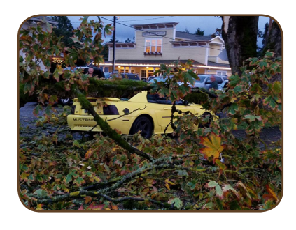
Treefall damage in the DariMart parking lot.

for that maintenance is limited. More important than monetary concern is safety of citizens. The memory of the car smashed flat in the Dari Mart parking lot last year left many concerned and well aware of the danger of old and diseased trees.