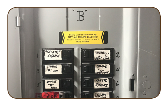
The breaker box still carries evidence of a previous incarnation of the Mathew House as KDUK headquarters.

Visit their website for more information! www.mathewhousedaycare.com