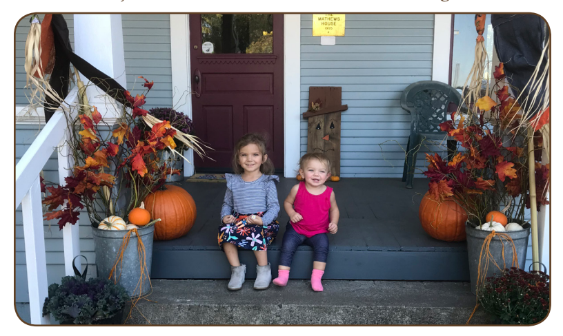
A few very small and very happy customers.

Who knew that turning a historical home into a cozy daycare would be such an adventure? As the Mathew House Daycare took shape within the landmark Pearl Street home, layers of past inhabitants were uncovered. Barb Hoffman and her family found surprises and unlikely treasures tucked away in every corner of the home. Some were structural finds that told stories of life in the past, like the east facing window near the kitchen that was probably used for ice block delivery, a precursor to modern refrigeration. Others were more recent, dating back to the middle of the last century, like the JIF jar with an incentive for free bubblegum with