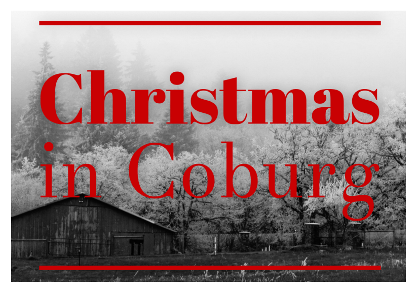
Stay tuned to our Facebook page and website for Christmas in Coburg schedules!

If you'd like to get involved in community activities, the Coburg Community Grange is a great way to do so. You can get in touch via coburgcommunitygrange.com or 541-228-8650. Thank you to all for the continued support of The Grange and community events!