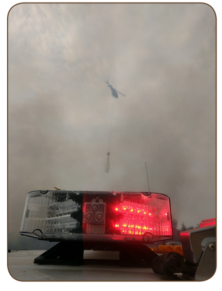
Helicopter assisting fire suppression

Being near the base of the Coburg Hills with the potential for rapid fire spreading into the neighborhoods in the hills, Coburg requested mutual aid assistance from fire districts across Lane County. Within minutes there were over 10 units and over 25 personnel assigned to the initial attack.