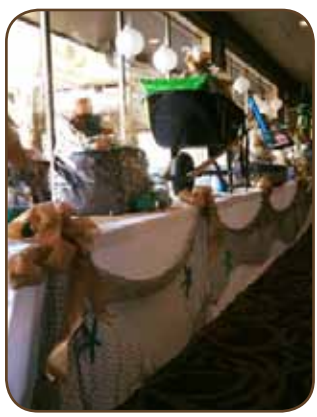
Class baskets for this year's auction – Theme "Dinner on the Beach"

A special Thank You to the following businesses and community members for their contributions at our auction: